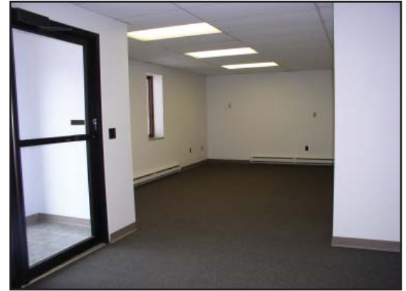
Left Side of Showroom