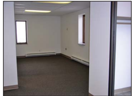
Right Side of Showroom