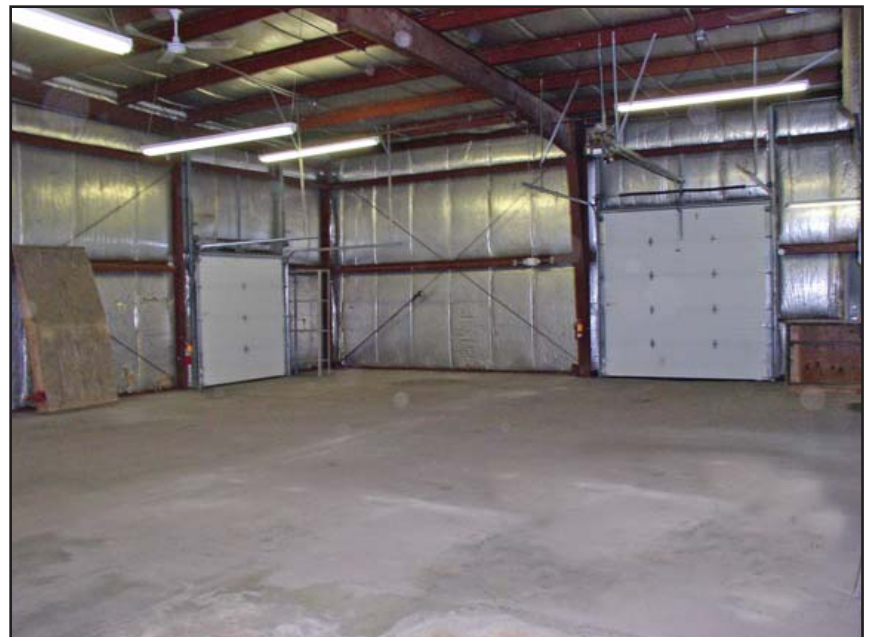
Loading Dock & Drive In Doors